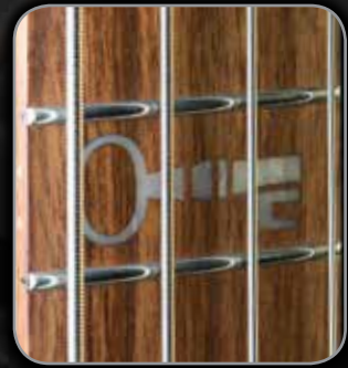
12TH FRET INLAY